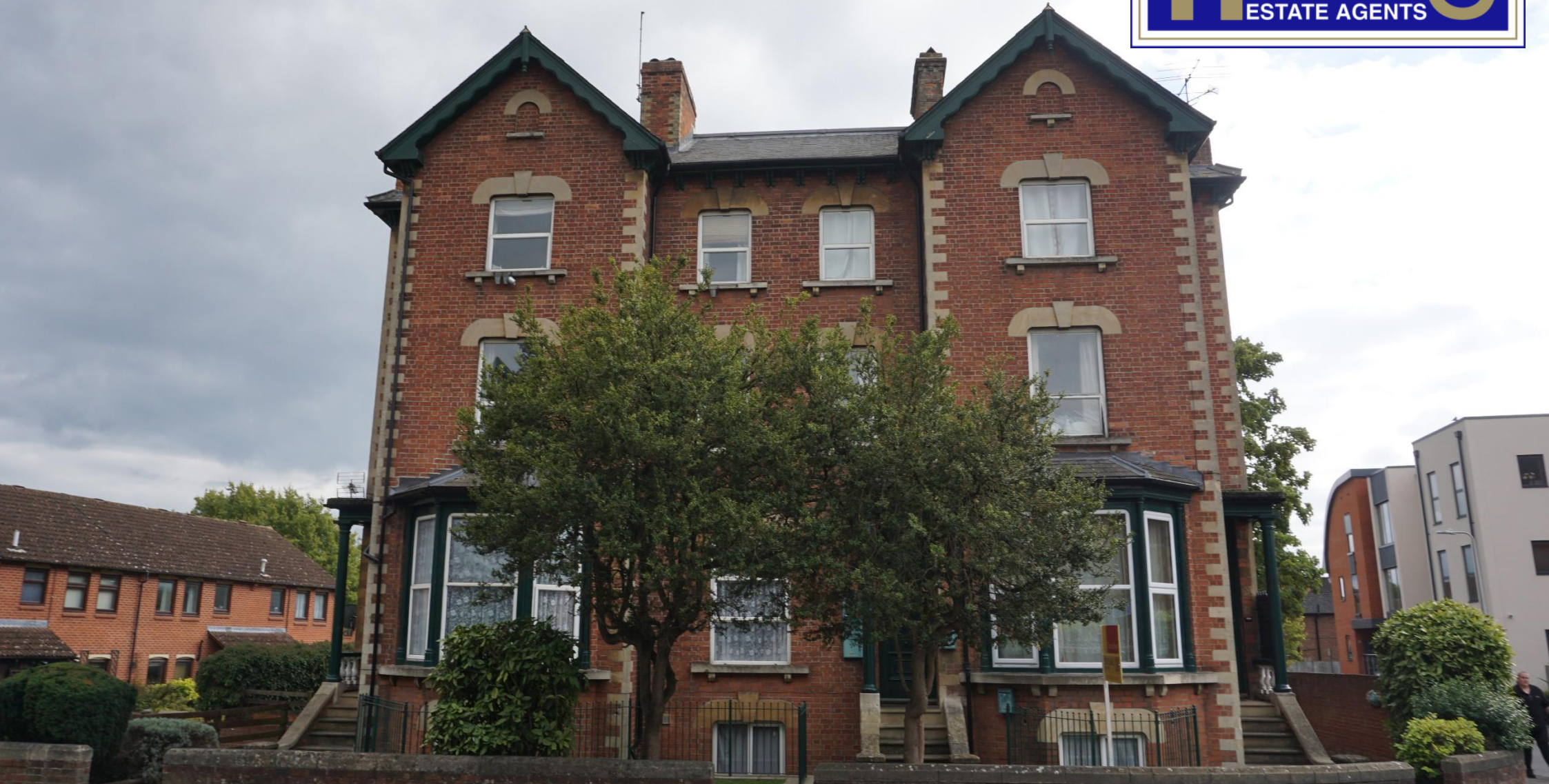
83A London Road Newbury Berkshire RG14 1JP